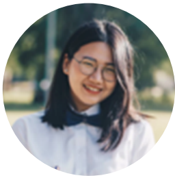
Nipapat Singhaveerasamorn Clubs Commissioner